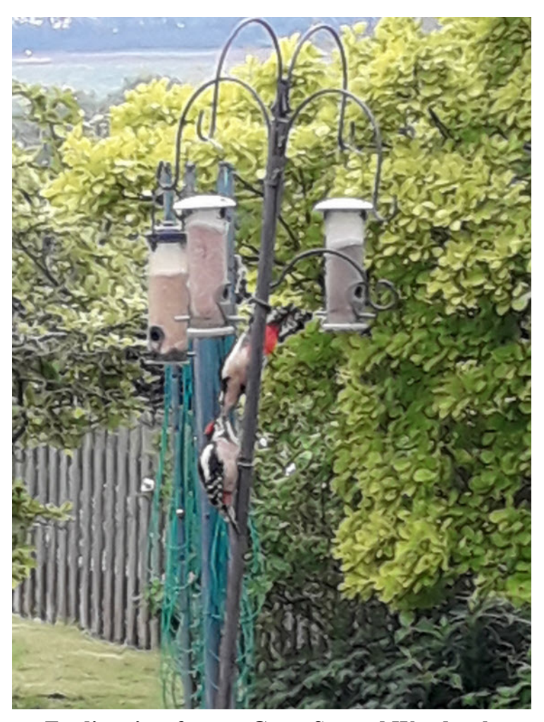
Feeding time for two Great Spotted Woodpeckers

Progressive Supper: Saturday 28th September. Theme to be announced!